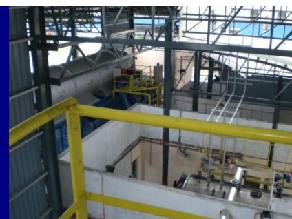
→ Energy Utilisation Heat Exchanger / Steam Boiler