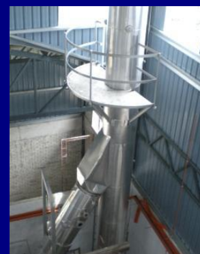
→ Exhaust Stack with CEM