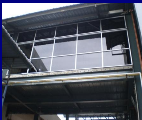
← Plant Control Room