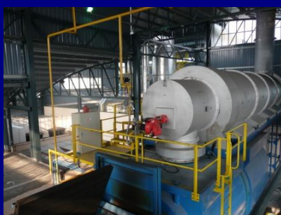
← Syngas Burner