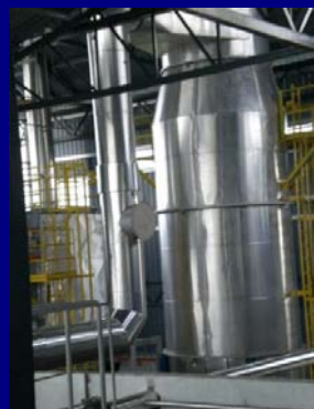
← Air Quality Control System